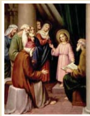
THE FINDING OF THE CHILD JESUS IN THE TEMPLE

Every year His parents went to Jerusalem for the festival of the Passover. And when He was twelve years old they went up as usual for the festival. When the festival was ended and they started to return...the boy Jesus stayed behind in Jerusalem but His parents did not know it... they started to look for Him. When they did not find Him they returned to Jerusalem to search for Him. After three days they found Him in the Temple, sitting among the teachers, and asking them questions. And all who heard Him were amazed at His understanding and His answers.